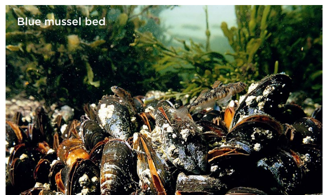
Blue mussel bed

Measures to protect biodiversity and ecosystem services, including carbon storage, through conservation tools such as MPAs should be implemented. UK governments have championed key international agreements (such as the Convention on Biological Diversity's Global Biodiversity Framework) where protection of nature and its services are specified for national implementation. A shift to whole-site protection of MPAs (rather than the current feature-led approach), and the consideration of blue carbon in marine planning, would ensure that the natural carbon capture and storage processes are safeguarded and/or restored by managing damaging activities. At the same time, this would help to increase the resilience of the natural environment while contributing to meeting Net Zero targets.