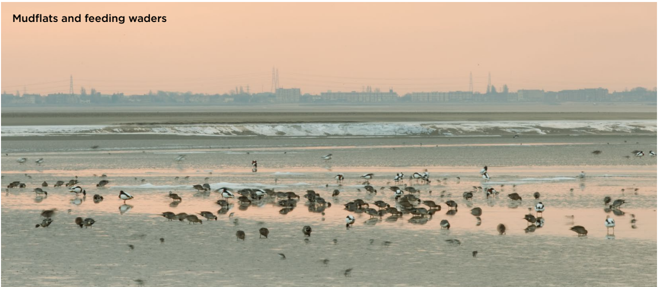
Mudflats and feeding waders